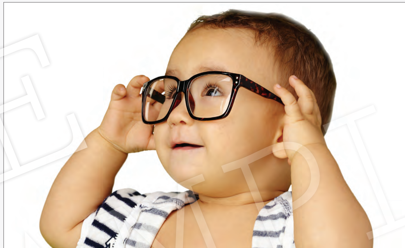
At our center we have our youngest and brightest on top of all the ministry's news and latest developments/WRC

FRIDAY, SEPTEMBER 5, 2015 | Year XXXVIII | Number 13.291 | CELEBRATION EDITION | Price: $ 2.50