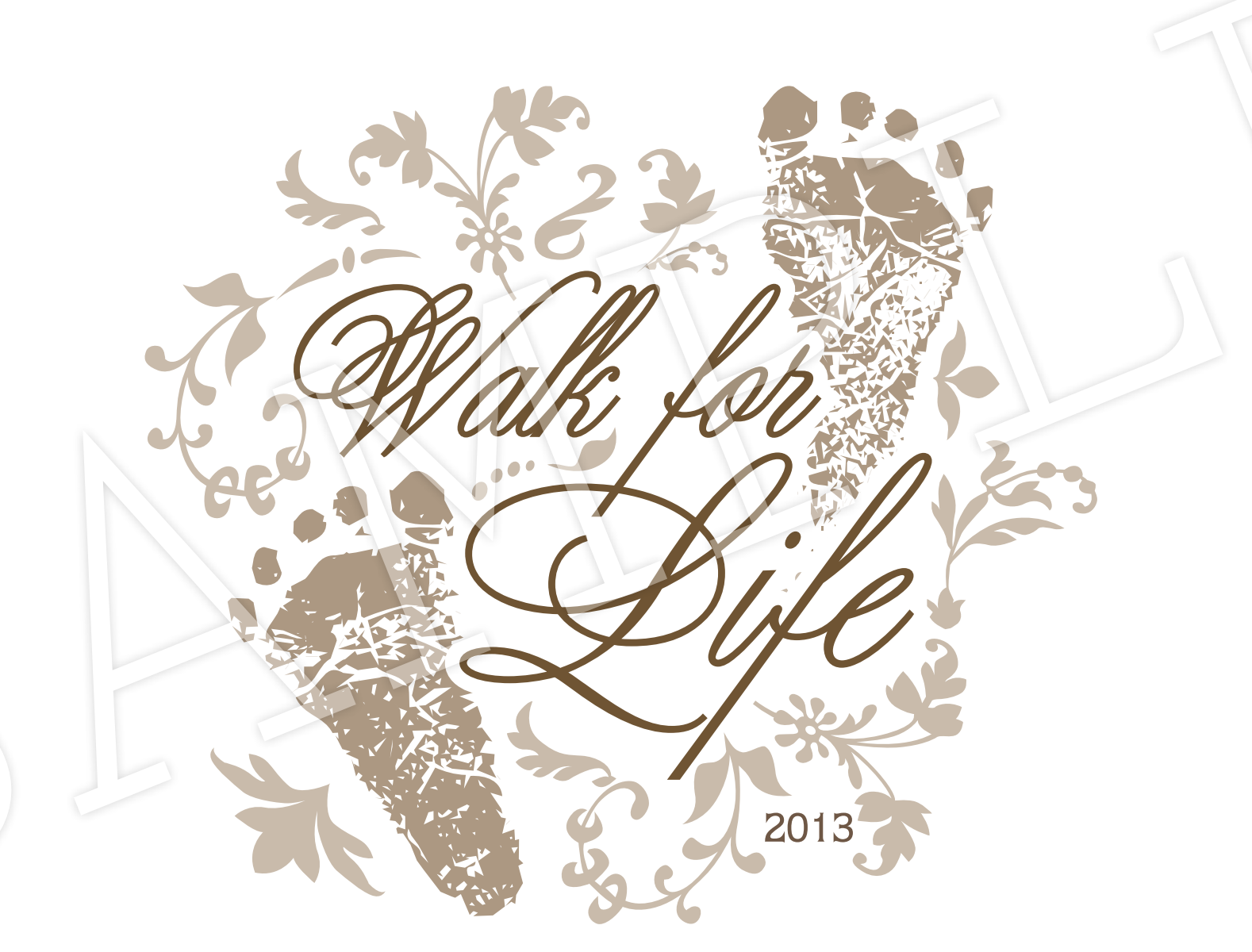
Cumberland Pregnancy Care Center